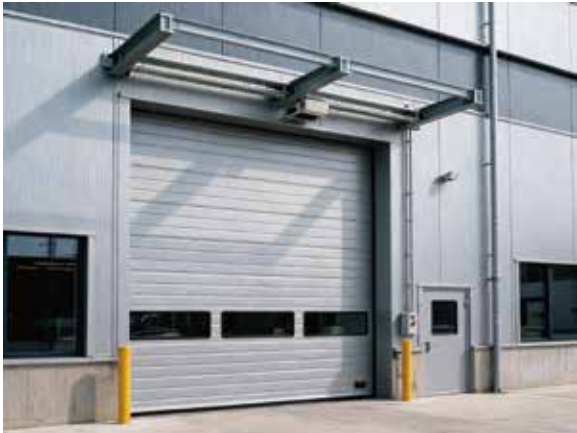
Electric Garage Door Panel Diagram