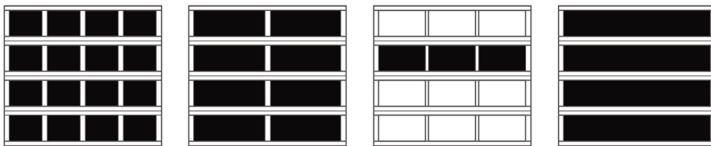
Exterior View 8x7 Short Short Square Partial Full Panel